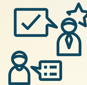
Coaching and Mentoring