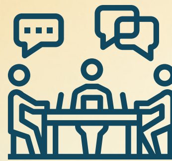
On the Job Training